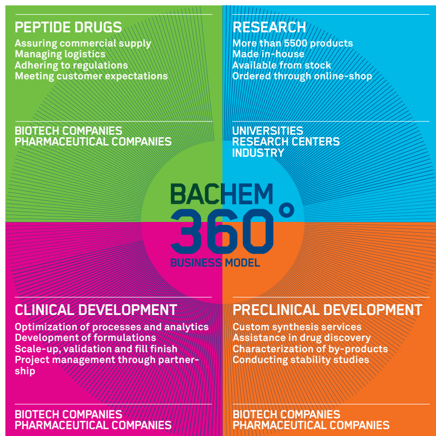
Fig. 1: The Bachem 360° business model.

In addition to the research grade products listed in our catalog and available from stock, Bachem offers an efficient and high quality custom synthesis service for peptides and amino acid derivatives. Our peptide chemists can prepare a wide range of compounds according to your specifications.